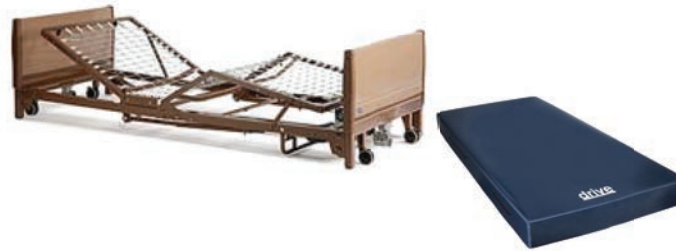
Home Care Beds & Mattresses